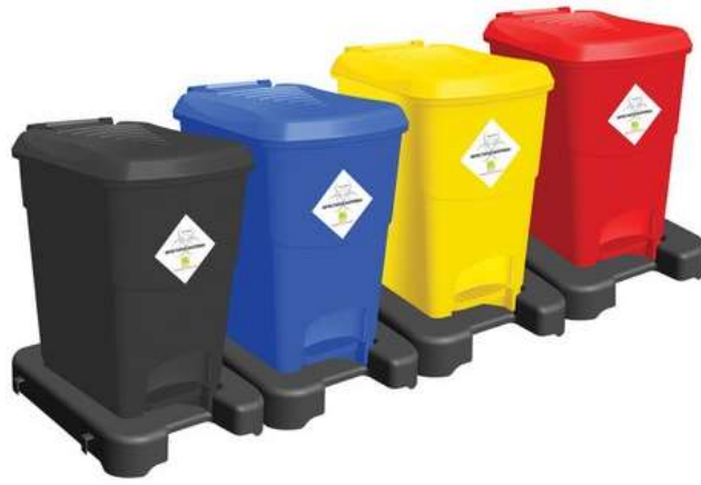
COLOR CODED GARBAGE BINS