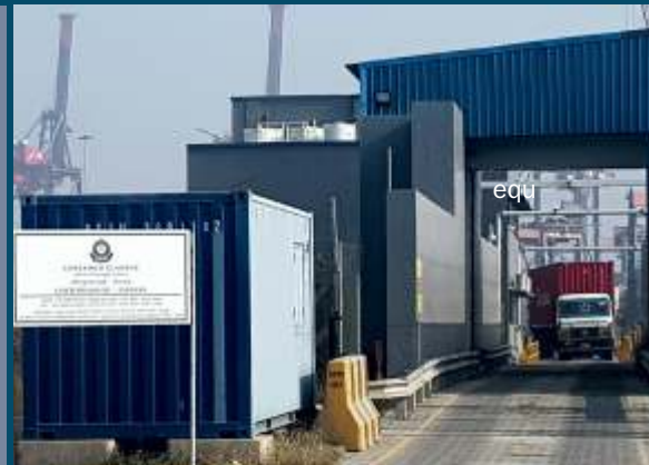
Drive-in container scanning which is digitally linked to the customs system via an API-based EDI solution for faster clearance