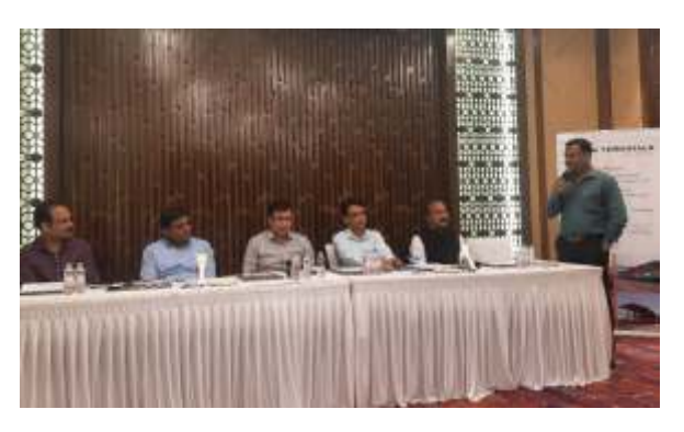
Key customers handling their business from Pipavav (IFFCO, KRIBHCO, NFL, RCF, MOSAIC) and the senior Western Railways team participated

To support constructive outcomes for our customers, APM Terminals Pipavav hosted the Railway-Fertiliser Industry Co-ordination Committee Meet, a quarterly gathering of Fertilizer Association of India (FAI) and Western Railways. The meet was aimed at addressing the operational challenges and requirements of our customers from the fertilizers industry. The Western Railways extended their solutions for timely turnaround of cargo stock from western ports.