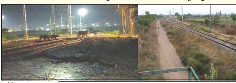
અમરેલી, રાજુલા પંચકમાં રેલ્વે ટ્રેક પાસે આવી ચડેલ છ સિંહોને વનતંત્રના રેલ્વે સેવક દ્વારા સુરક્ષીત જગ્યાએ ખસેડી તેમનો જીવ બચાવવામાં આવ્યો હતો.

બે સિંહા અને ત્રણ બચ્ચા સહિતના પરિવારે રેલ્વે ટ્રેક કોસ કરેલ : ટોરેન્ટ પાસે એક સિંહ ટ્રેક નજીક આવી ચડેલ