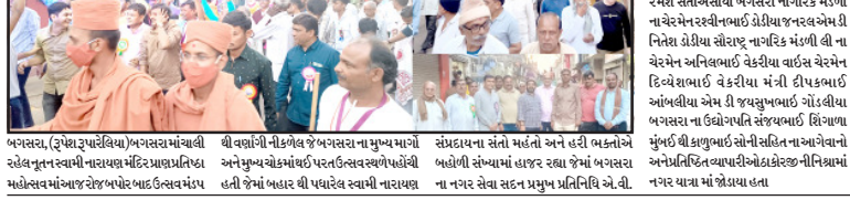
વિવિધ ધર્મના માર્ગદર્શક યાત્રા નવા શ્રેણીમાં સમાવેશ કરવામાં આવ્યો. આરતી કરવામાં આવ્યો.

નગર યાત્રાનું આગેવાનો તથા ધર્મપ્રેમીઓએ સ્વાગત કર્યું: હરિભક્તો ઉમટ્યાં